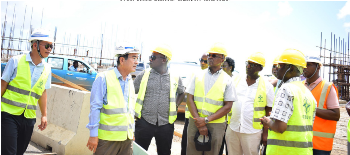
KRA Board of Directores during a briefing at the Lamu Port.

corridor. The first berth, which is 400 metres long and 17.5 metres deep, was completed in early August this year. The port will have 32 berths in total. KRA has already deployed 12 staff to manage Customs clearance operations at the port.