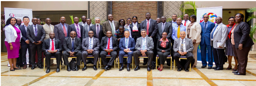
Participants at the 5th Tax Roundtable held in Nairobi.

KRA held 72 engagements at Commissioners and Technical levels, among them, 12 public participation forums on selected tax legislations, programmes and policy regulations. Following these engagements, several system and process enhancements were implemented while some of the proposals were part of legislative and policy changes effected during the year.