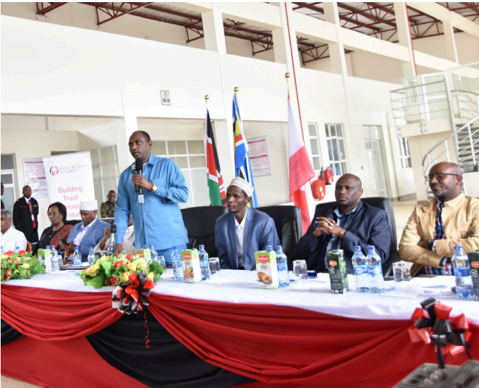
Hon. Amb. Ukur Yatani, Ag. Cabinet Secretary, National Treasury & Planning, addressing stakeholders at Moyale One Stop Border Post.