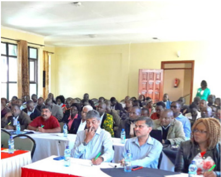
Stakeholders at a public participation forum.