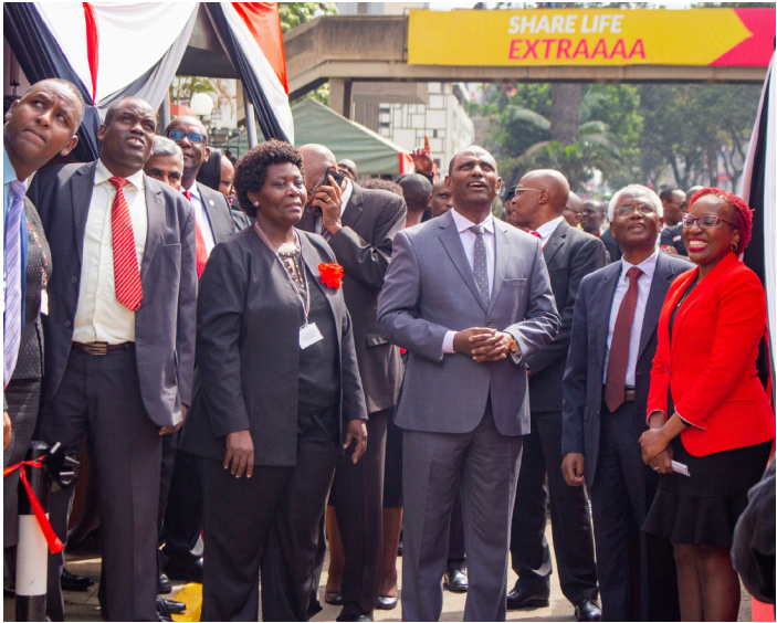
Hon. Amb. Ukur Yatani, Ag. Cabinet Secretary (C), National Treasury & Planning with Amb. Francis Muthaura, KRA Board Chairman (2nd R), Board of Directors and senior management during the launch of the Taxpayers' Day celebrations.